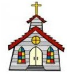
Budget & Congregational Meeting

We as a church family are also getting ready for the new year. As part of those preparations we will have our Budget and Election meeting on Sunday, November 16 after the worship service. At this meeting we will elect leaders and discuss and adopt a budget for 2015. Please be in prayer for the decisions which will be made that day; come and be a part of this very important process.